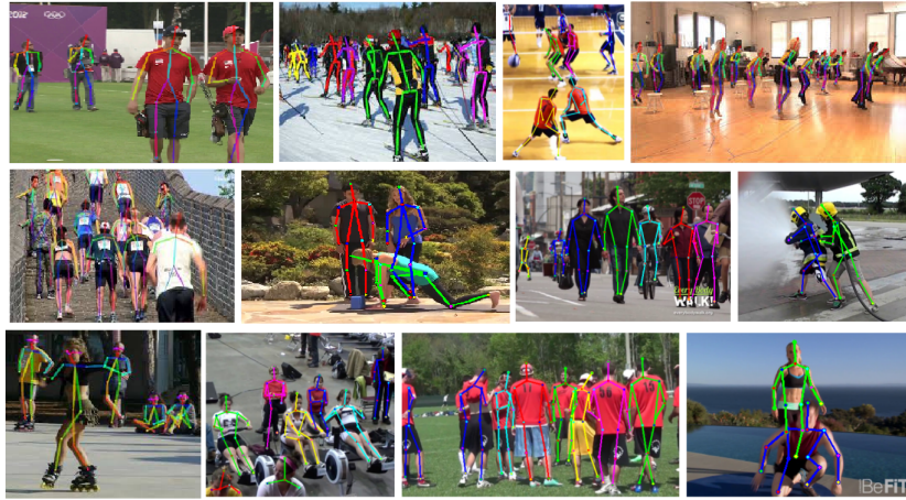
Fig. 3: Various qualitative results from the COCO datasets e.g. in the case of walking, roller skating, basketball, exercise, inline skating, crossing, sitting, racing vehicles and so on.

(72.7 vs. 72.2). Furthermore, our network has greater GFLOPs than other networks, suggesting that it is also more efficient.